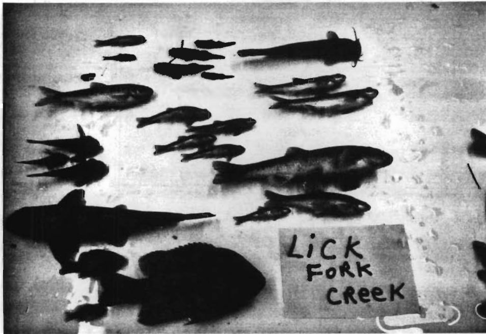
Representative Individuals of all Species