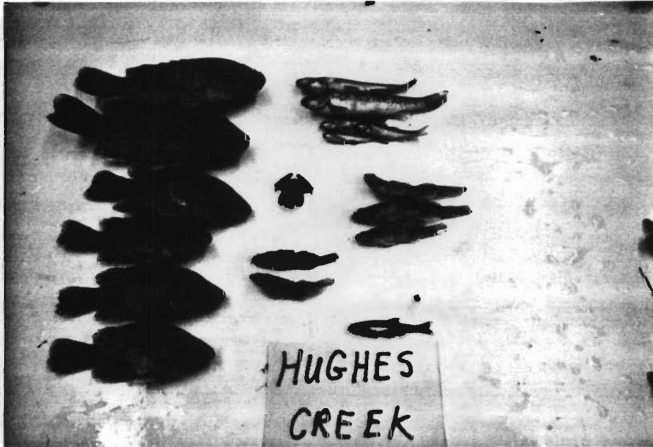
Figure 3. Total Fish Population Collection from Hughes Creek below the Mt. View STP on December 4, 1984.