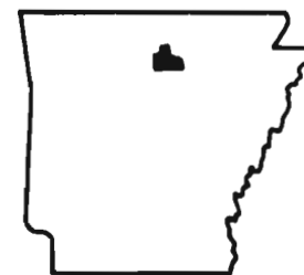
Figure 1 MAP OF STUDY AREA